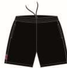
SHORTS (CHOICE 2)