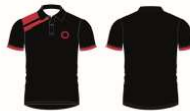
SHORT SLEEVE POLO SHIRT* (CHOICE 1)