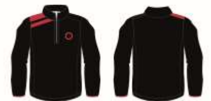
1/4 ZIP MIDLAYER SPORTS TOP* (OPTIONAL)