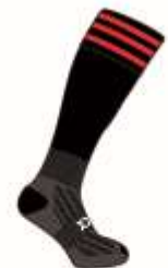
SPORTS SOCKS (OPTIONAL)