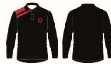
LONG SLEEVE POLO SHIRT* (CHOICE 1)