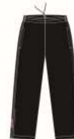
TRACKSUIT BOTTOMS (CHOICE 2)